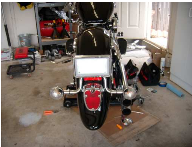
Original Plate and Signal

• Kuryakyn makes an awesome unit for the Roadstar and with a little work it will fit the Vstar Classic as well.